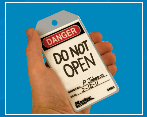
A brand new message ready for the next project