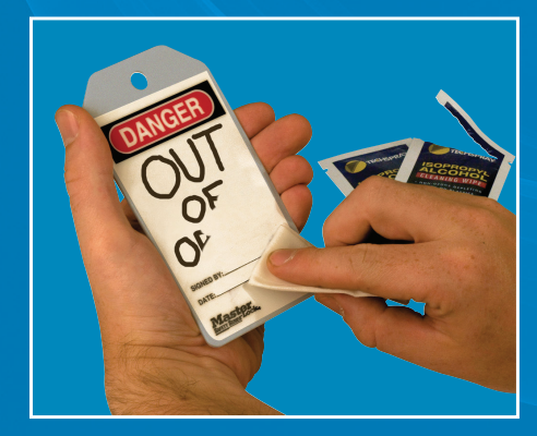
Wipe off current message with Isopropyl Alcohol